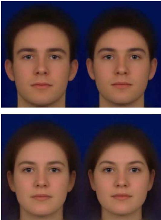
Fig. 1. Male (top row) and female (bottom row) face images manipulated to increase (left) and decrease (right) masculinity of shape (sensu Penton-Voak et al., 1999; Perrett et al., 1998).

Stimuli were 12 pairs of face images varying in sexual dimorphism of shape and matched in other dimensions (Fig. 1; see Perrett et al., 1998; Tiddeman et al., 2001 for methods). Each pair of faces comprised a masculine and feminine version of the same face (6 male, 6 female). In brief, masculine male and feminine female faces were manufactured by exaggerating the differences in shape between female and male face prototypes (or sample averages). Feminine male faces were manufactured by shifting the face shape towards the shape of the average female face and masculine female faces were manufactured by shifting the face shape towards the shape of the average