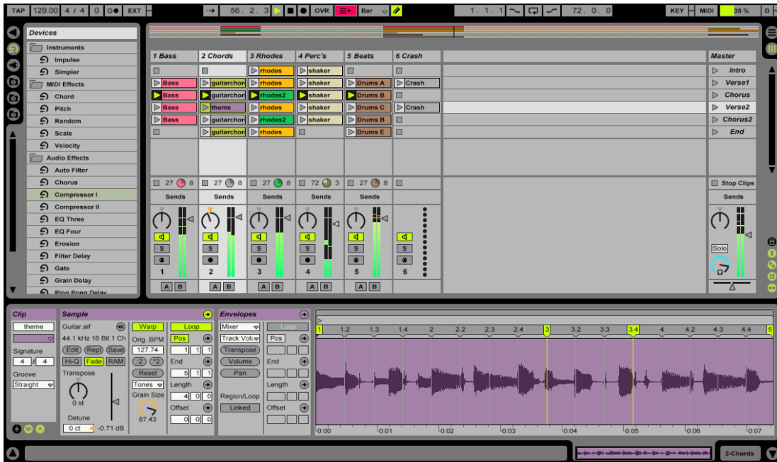
Fig. 1. Ableton Live software interface

On the dimension of provisionality , Ableton can offer immediate gestural rate control via the definition of MIDI mappings and shortcut key commands for toggling mixer states. These allow the live performer to adapt sound immediately and continuously. In fact, ChuckK can do the same; but these mappings must be explicitly laid out as code defining the control flow, whereas Ableton has a simple set-up mode for mapping MIDI and keyboard controllers. Neither program can be said to offer simultaneous control of multiple elements without such mappings, for Ableton is otherwise bound to the click and drag paradigm, whilst ChuckK just involves typing without any mouse use at all. An interpreted code line, however, can have general consequences for many parameters at once, whereas Ableton has not even the simplest macro facility.